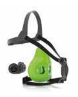
EASY AND FAST MAINTENANCE It can be disassembled in less than a minute making cleaning and maintenance much easier.

Fixed on 2 points directly on the rigid body of the mask allowing to distribute the weight of the respirator evenly without leaving face marks.